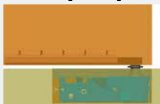
With integrated door arm