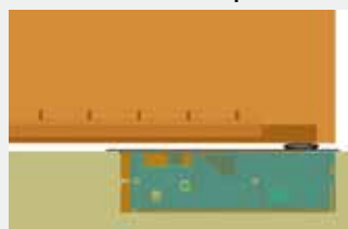
With integrated door arm