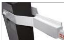
Double beam fixation with fork