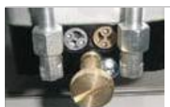
By pass valves