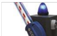
Bright LEDs. Flashing lamp . Opening with key