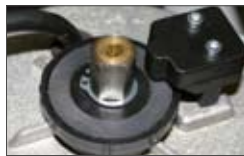
Mechanical twin-disc clutch (only for SATURN OIL)