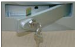
In option release with aluminium lever and lock (optional for SATURN E and G1)