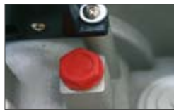
The SATURN OIL versions are with oil lubrication of the gears for max duration