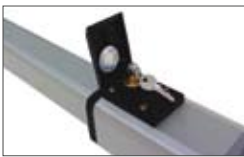
Release with lock in case of electric power cut