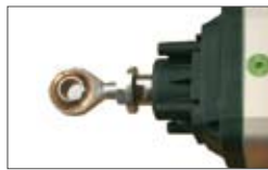
Round joint for stroke adjustment